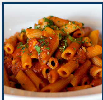
Pasta Napoli ✓